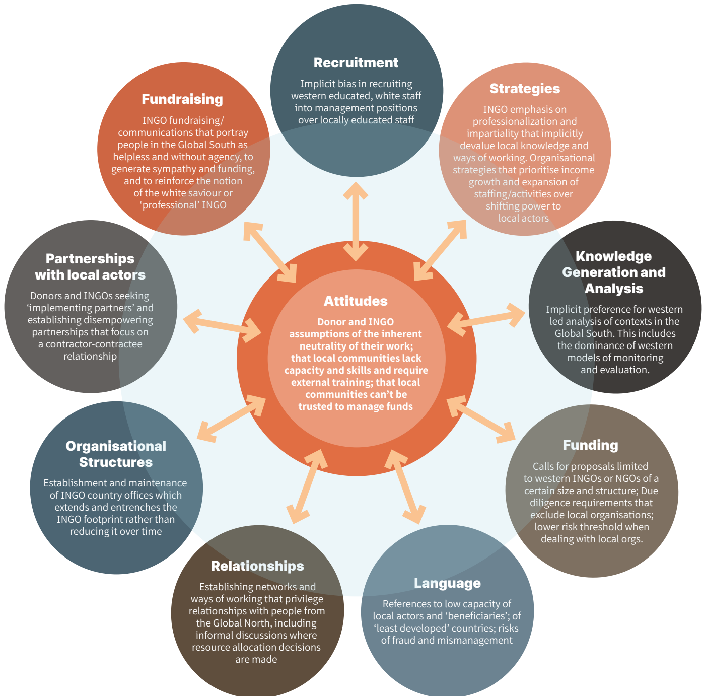
Diagram How structural racism shows up in the sector